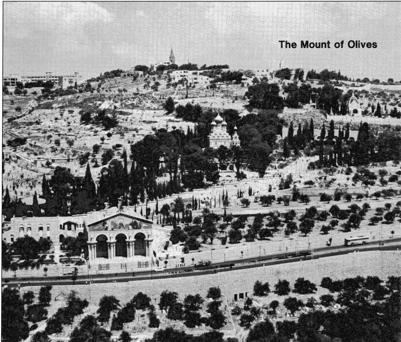
The Mount of Olives