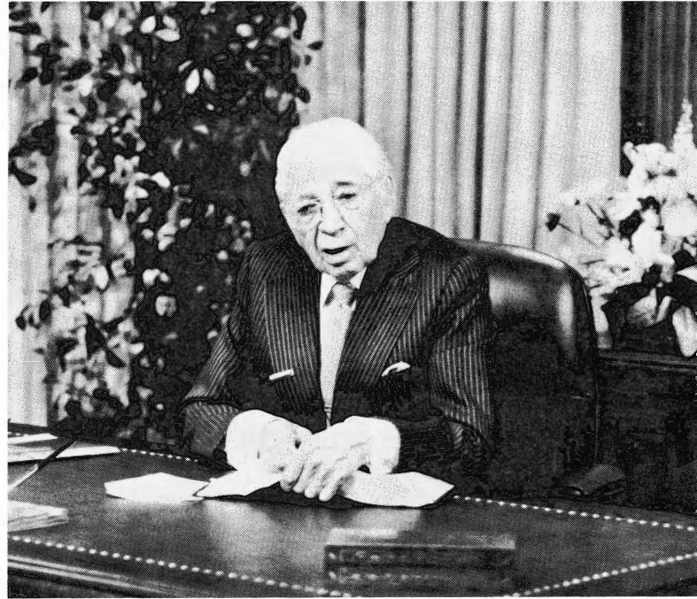
AT THE END TIME no one would know the precise day or hour of Christ's return. But shortly before He returns, His gospel of the Kingdom of God would be preached to the world as a "witness unto all nations" (Matt. 24:14). Herbert W. Armstrong, Pastor General of the Worldwide Church of God, is proclaiming that same gospel on "The World Tomorrow" television program.

Let's see if we can determine from these prophecies the exact time of His coming.